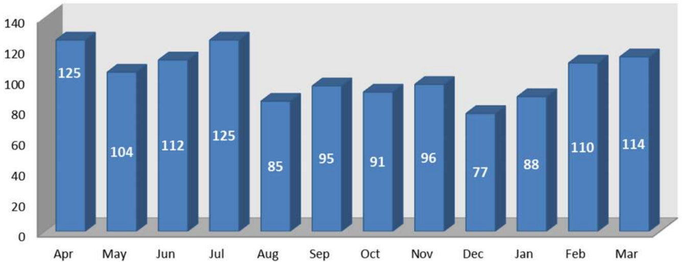
Cumulative Value of Food Delivered @ £40 per Parcel